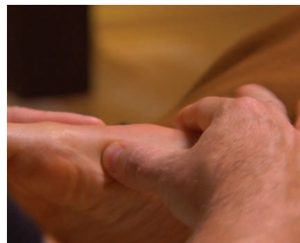
The Chakra 4 reflex, or the heart chakra (thymus gland), is located on the spine reflex approximately one finger's width below the head of the first metatarsal. This is part of the pathway to the body's immune system defense.