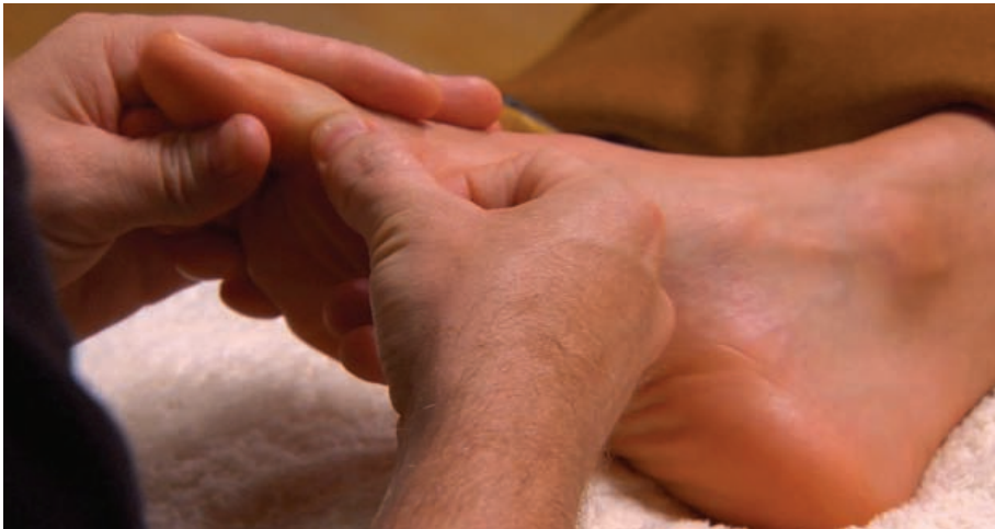
The Chakra 5 reflex, or the throat chakra (thyroid gland), is located on the inside arch of the foot (one finger's width above the head of the first metatarsal). It relates to expression and growth.