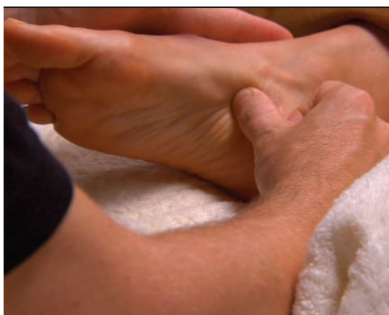
The Chakra 3 reflex, or the solar plexus chakra (pancreas), is located on the inside arch of the foot (approximately halfway between the tip of the big toe and the heel). It is related to fire and digestion and the transformative process.