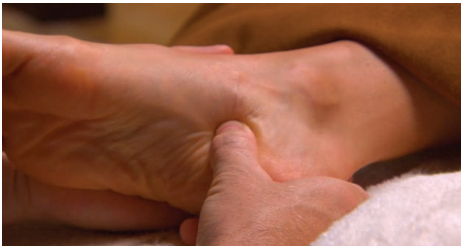
The Chakra 2 reflex, or the sacral or spleen chakra (reproductive glands), is located on the inside arch of the foot at the third lumbar vertebrae reflex approximately four to five fingers' width below the head of the first metatarsal. It is associated with sexuality and reproduction.