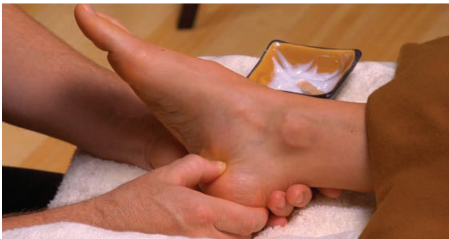
The Chakra 1 reflex, or the root chakra (adrenal gland), is located on the inside arch of the foot at the heel. It relates to our basic needs and survival.

The third technique utilized in the Chakra Balancing Massage is chakra energy work. The focus of the energy work is a light touch over the chakras while concentrating on intention. When working with the chakras, the most important aspect is not your technique, but your intention